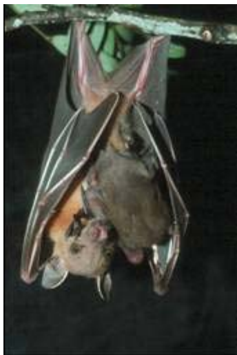
Cynopterus brachyotis

km 2 park is situated at latitude 18°51'N and longitude 098°52'E, and the elevation is 1,020 m a.s.l. The park is covered with hill mixed deciduous forest comprising more than 2,000 species of flowering plants and ferns (Gray et al. , 1994). The climate is seasonal with a minimum temperature of 6°C and maximum of 41°C, with an average annual mean temperature of 25°C, and a mean annual rainfall of 1,268 mm. Netting stations were located in tree plantations and disturbed habitats with partially open, sparse to moderate undergrowth, saplings and trees. There was some flowering and fruiting of trees in the park as well as flowering and fruiting of fruit orchards in nearby villages.