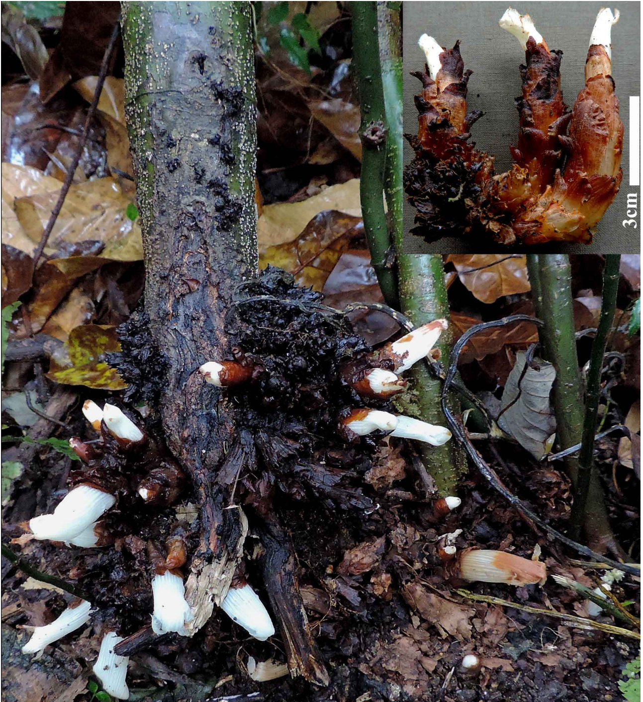
FIGURE 1. Gleadovia konyakianorum in nature.

Etymology: —The new species is named in honor of the Konyak tribe of Nagas predominantly inhabiting in the Eastern Nagaland, Northeastern India.