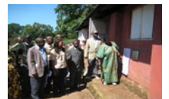
Minister unveils the plaque