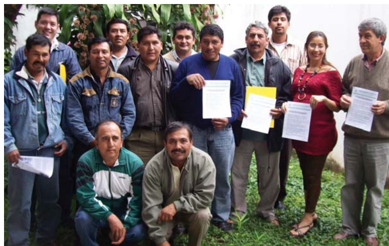
Signing the Cooperative agreement.

The objective of this tripartite alliance was to conserve the environmental services of the watershed through conservation of native forest and restoration of degraded ecosystems. The way to reach this goal was to establish a compensation system that could meet or exceed the opportunity cost of landowners who would be asked to adopt watershed-friendly land use practices. In order to be sustainable the scheme needed to involve the farmers of the upper, middle and lower watershed in commitments for mutual cooperation, considering that they have complementary interests. The scheme's designers assumed that fair compensation would gradually build support for upstream families to help provide environmental services, while downstream users, benefitting from the results of improved land use practices, would be more inclined to invest their own resources to expand the scheme. In theory, the vicious cycle of deforestation, erosion and low productivity could be transformed into a virtuous cycle of conservation, restoration and enhanced incomes.