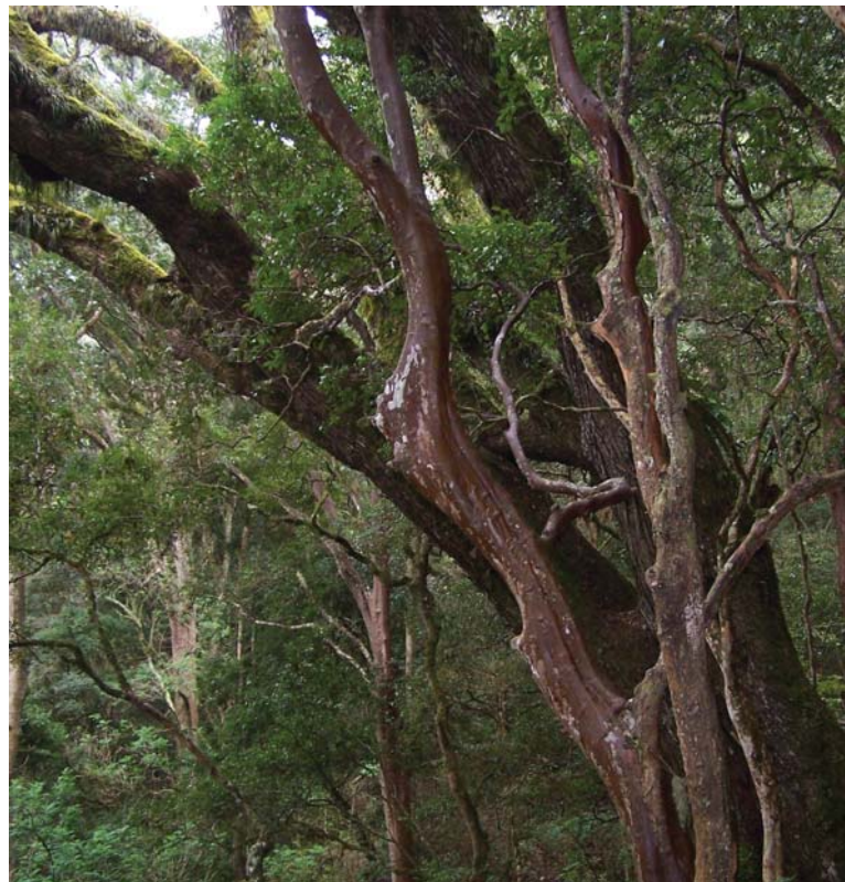
Comarapa cloud forest.

There is still much work to be done to consolidate the Comarapa Water Fund, but experiences elsewhere in Bolivia (Asquith et al 2008) and around the world (Asquith and Wunder 2008) show that incentive-based watershed management, be it a Water Fund or payments for environmental services, can simultaneously enhance natural resource management and improve local livelihoods.