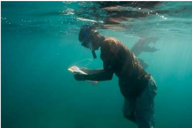
Students practice Reef check survey methods in turbid waters

The Coastal Academy is now a registered centre for delivery of courses in the above internationally-standardised methods. The logos from these bodies are included in the final certificate awarded to course participants on completing the qualification.