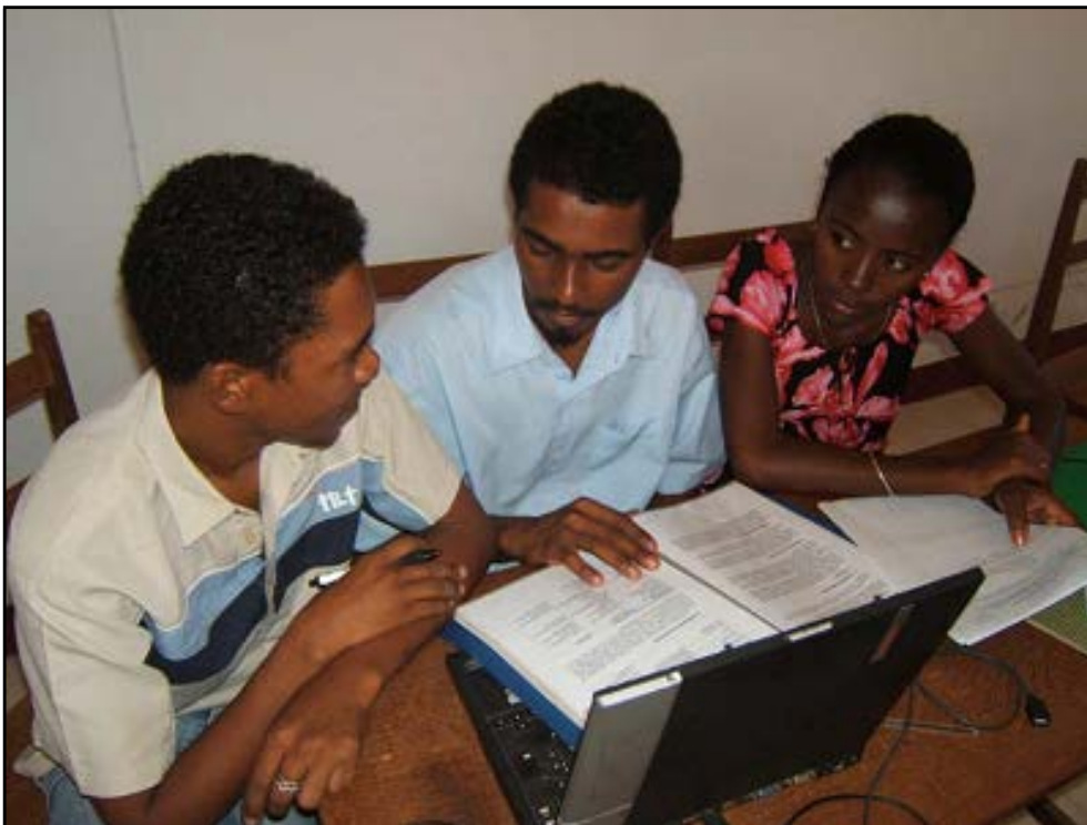
Students completing a group assignment on marine protected area management

In total six staff were trained in delivery of the ASDAN qualification and the various coastal habitat monitoring modules.