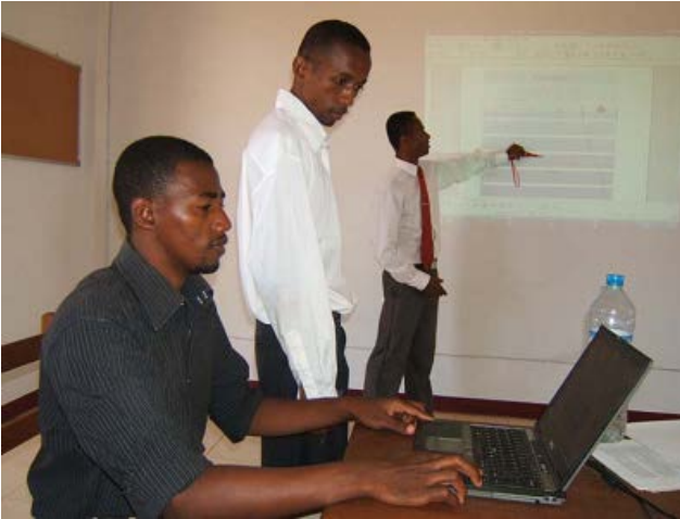
Students give a presentation to their class based on their group research assignment