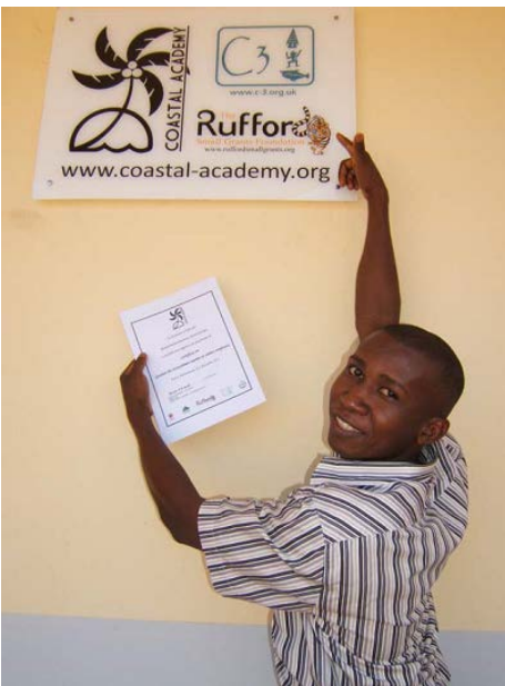
A proud student shows off his certificate outside the Coastal Academy teaching facility