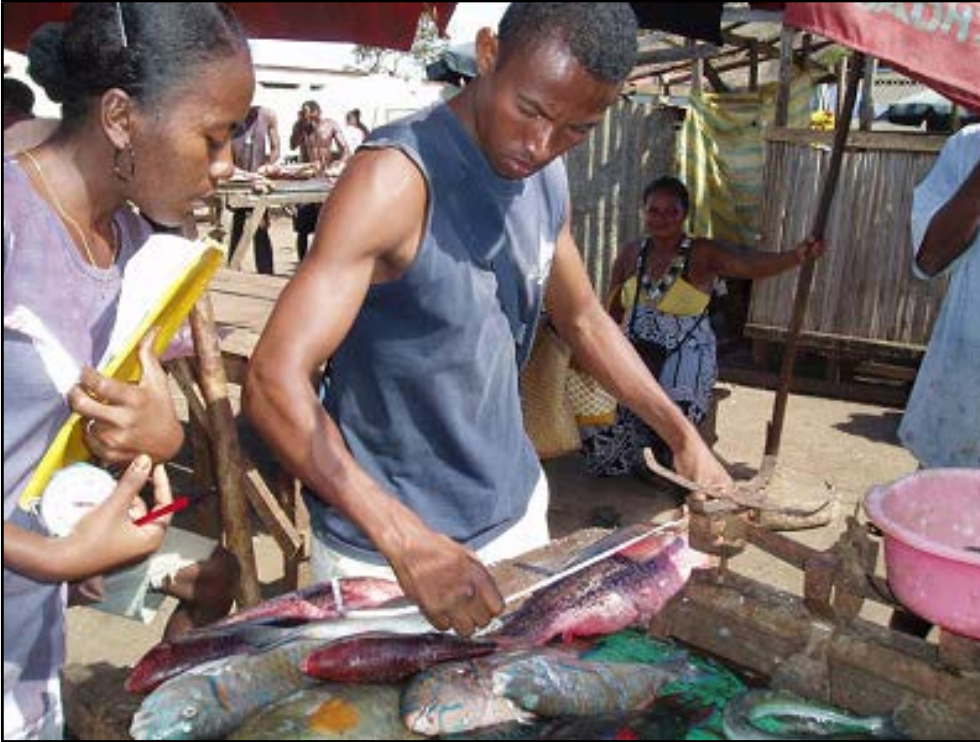
Students gather biometric data from reef fish at the local market, Antsiranana