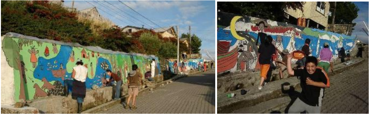
Figure 3: Awareness-raising through artistic activities.

authorities, each with different interests and representing different constituencies. Even local conservationists have highly disparate views as to how to protect the local environment (ranging from the very radical, to those that are willing to tolerate some level of extractive and other disruptive activities).