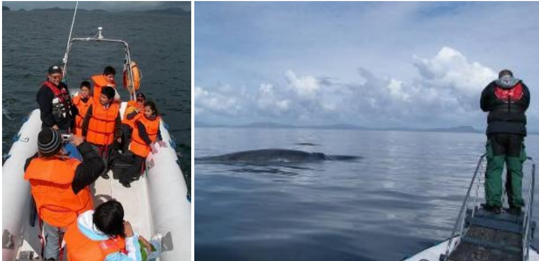
Figure 1: Educational activities with children (left panel) and photo-id work (right panel) undertaken on board CBA vessel, R/V Musculus.

To add to this financial trouble, fuel costs soared during the implementation of the project. Fuel is in fact a key input for all marine based activities. Furthermore, the purchase of a project truck came at a higher cost than budgeted.