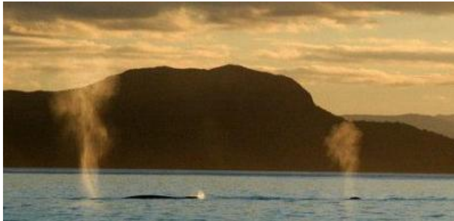
Figure 4: A blue whale mother-calf pair photographed in the Moraleda Channel during field season