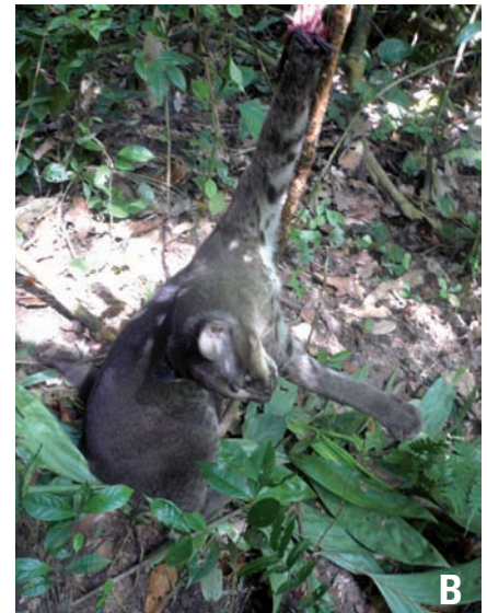
Fig. 2. (A) Camera trap photo of African golden cat in Mpem et Djim National Park, Cameroon (event 1); (B) snared golden cat in the MDNP.

the golden cat (that is, not close-sequenced images) for each camera station divided by the total number of trapping days at each station (Bahaa-el-din et al. 2016). Bruce et al. (2018b) obtained a mean capture rate of golden cat of 0.58 (\pm 0.15) independent photographic events per 100 trap days in one camera trap survey of the Dja Biosphere Reserve DBR, Cameroon (note that several other nearby DBR grids did not document golden cat). Bahaa-el-din et al. (2016) had capture rates ranging from 10.5 to 20.9 events per 100 trap days in five different sites in central Gabon.