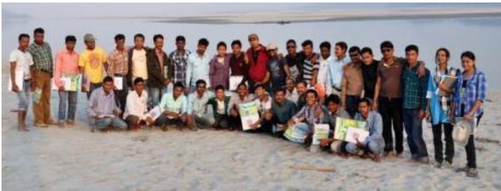
Fig-7: DCN Members in advance DCN training in November, 2011