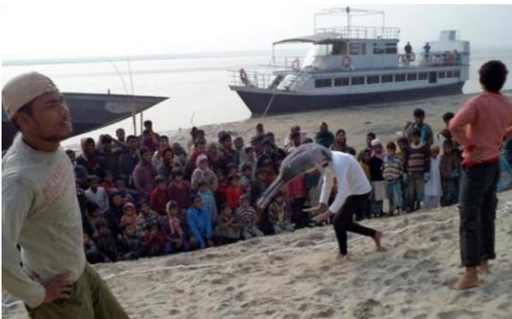
Fig-3: The boat 'S. B. Kahua' was widely used in winter, 2011-12 for conducting dolphin conservation awareness campaign. Here the education team is performing a drama on dolphin conservation in the river side, using the boat to reach the site and attract the local community