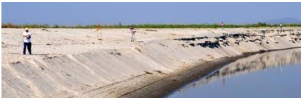
Fig-8: Land-based dolphin and habitat monitoring practice for DCN members in Nov, 11 DCN training