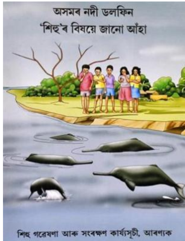
Fig-10: Booklet developed by the Project for mass awareness campaign