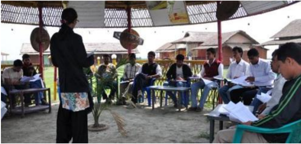
Fig-6: March, 2011 DCN training