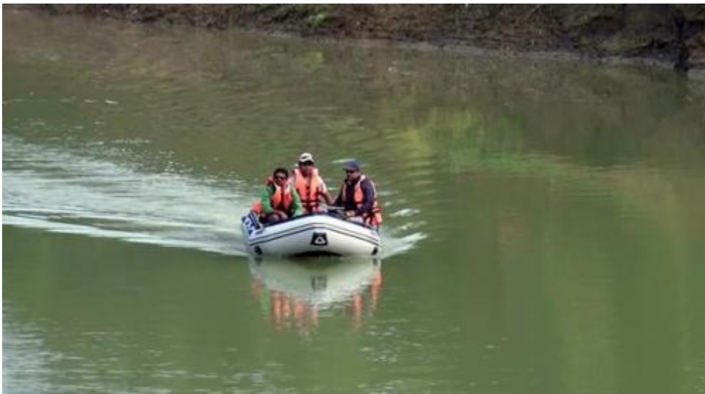
Fig-12: DRRT team in urgent conservation actions of three stranded dolphin in Dikhow River in Dec, 2011