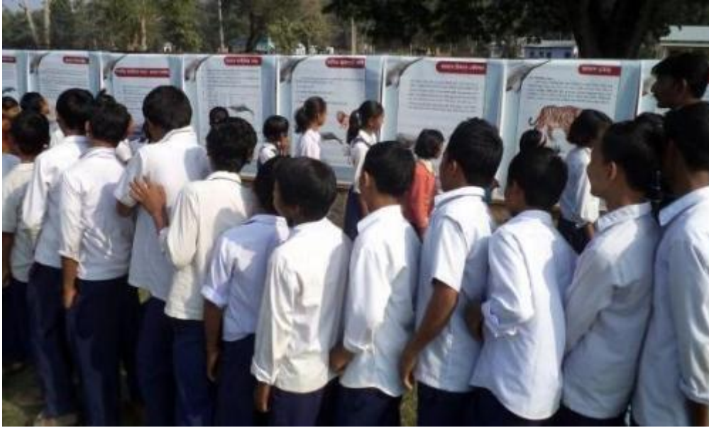
Fig-11: Booklet pages turned into big flexes for education programme during the Dolphin Yatra. Here the school students were participating in the education programme