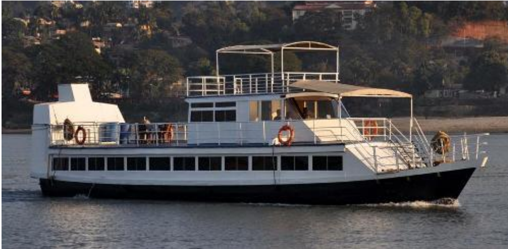
Fig-1: The boat 'S. B. Kahua' constructed with the help of RSGF Grant. This is a great resource for the long term research and conservation works on the Brahmaputra dolphin and wider riverine ecosystem