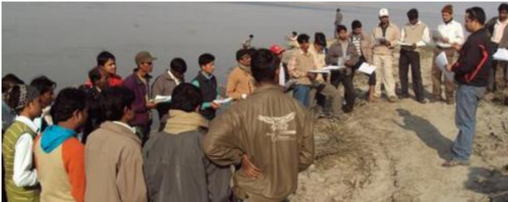
Fig-5: DCN training in February, 2010