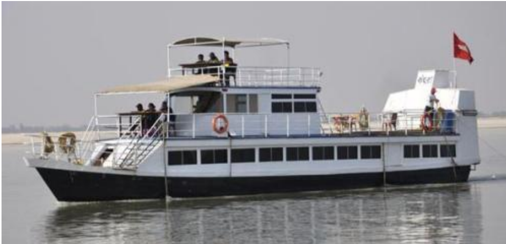
Fig-2: The boat 'S. B. Kahua' during Brahmaputra dolphin survey, 2012. Here two observer teams, each comprising of 3 members are conducting dolphin survey in Brahmaputra River.