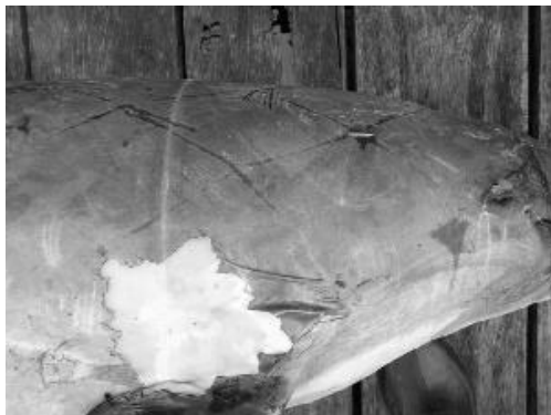
Figure 2. S. fluviatilis lactating female (ID-404) showing gillnet marks as a result of fishing gear entanglement

There were 1,197 h of carcass search effort. Remains of ten dolphins were found (five I. geoffrensis and five S. fluviatilis ) (Table 1). Evidence of interaction with fishing gear consisted of gillnet square marks along the body, and scratch and/or abrasive marks around the peduncle area, head, or rostrum (Figure 2). Two I. geoffrensis (ID-405 & ID-004) and two S. fluviatilis (ID-321 & ID-327) that apparently did not suffer direct interaction with fishing gear exhibited evidence of physical violence before death, with either blows on the head, stab wounds, or knife-cuts in vital areas. Three other dolphins with gillnet marks around the rostrum and flanks, flippers, or flukes were used as bait (ID-343 & ID-386 I. geoffrensis and ID-218 S. fluviatilis ) for the piracatinga fishery (Figures 3 & 4). Identification of gillnet type was possible in four S. fluviatilis carcasses: 100 mm-mesh size cotton gillnet (ID-404) and 90 mm-mesh size nylon gillnet (ID-025, ID-026 & ID-027), both used for fishing tambaqui ( Colossoma macropomum ) and pirapitinga ( Piaractus brachyomus ).