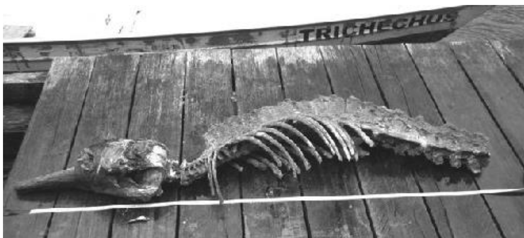
Figure 4. I. geoffrensis (ID-343) after being used as bait

Moderate (C3), Advanced (C4), and Skeletal Remains (C5) (Table 1). Pathological, genetic, and stomach content samples are currently being analyzed and will be presented elsewhere (Iriarte & Marmontel, unpub. data).