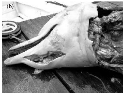
Figure 3. (a) S. fluviatilis lactating female (ID-218) on 28 March 2011 before being used as bait for the piracatinga fishery, and (b) fished carcass remains recovered on 31 March 2011