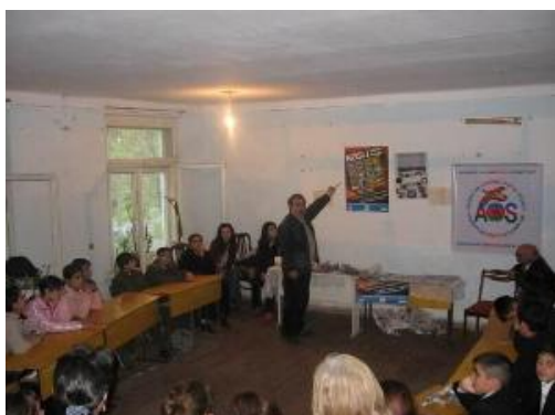
Training on bird identification at Ecological school Hajigabul district

Trainings were organized for people (schoolchildren, students, hunters, fishermen) on bird identification, simple monitoring methods, bird counting for regular monitoring of the site by locals. As well the binoculars, field guides were distributed among the locals.