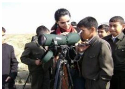
Field training for local Children – Police organization members