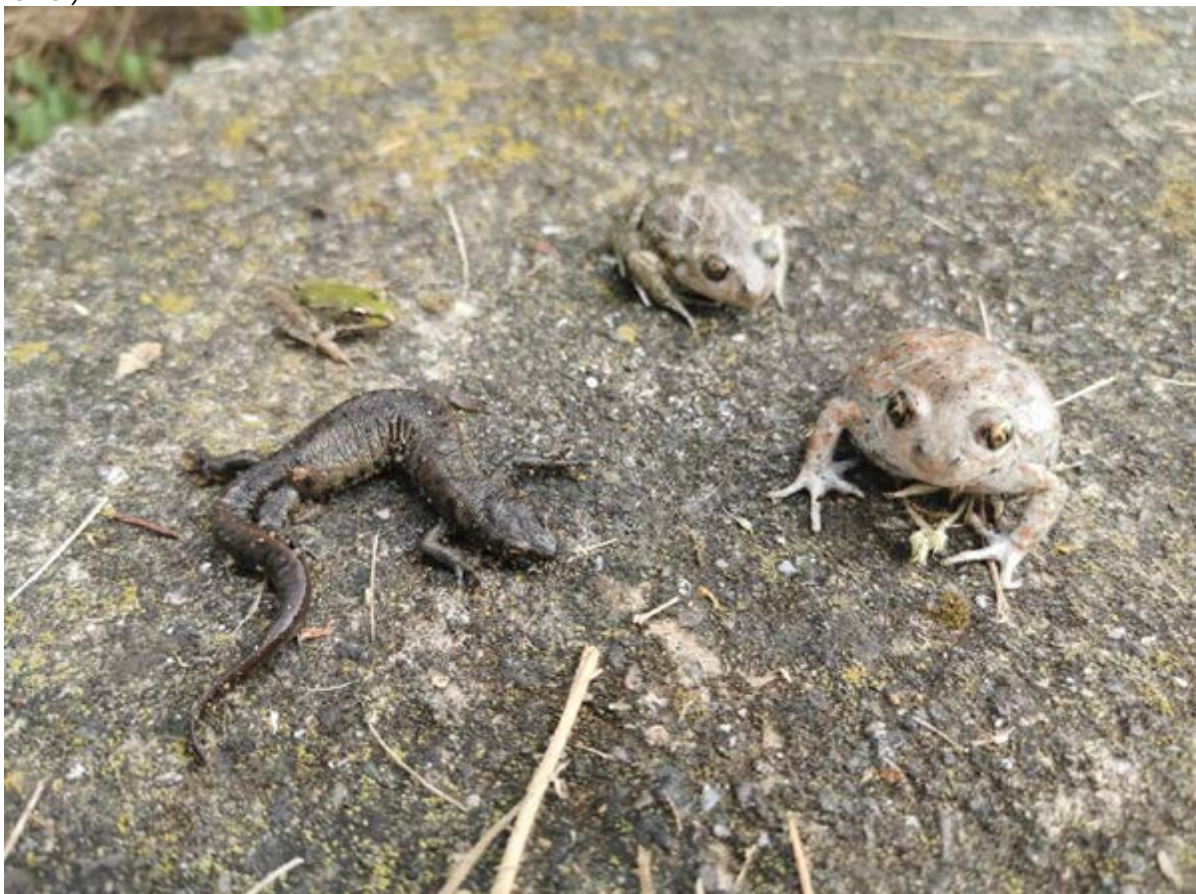
Fig. 4. Green frog, European spadefoot toad and Danube crested newt found and saved from local manhole