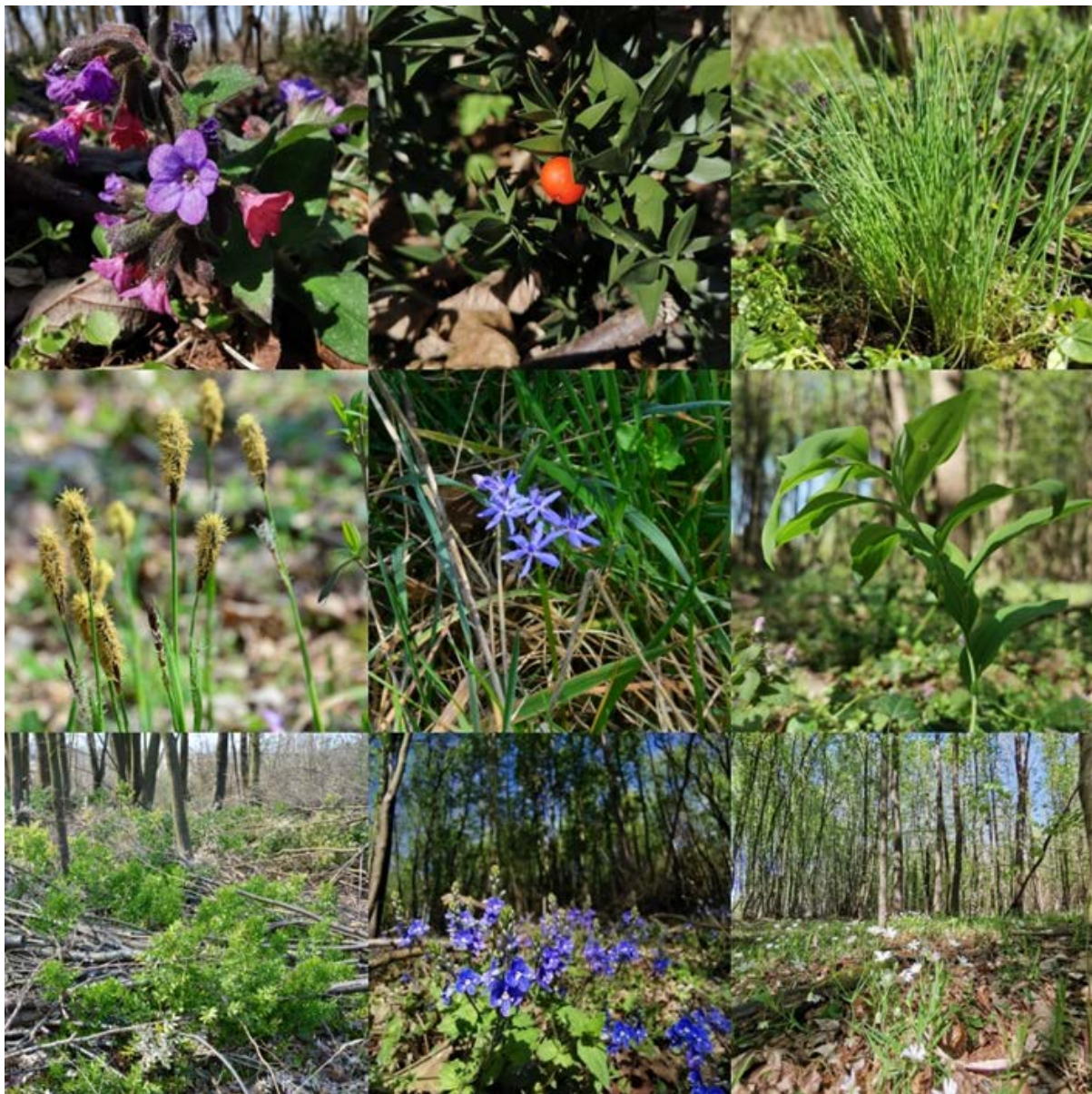
Fig. 2. Plant species and woodland habitats

Flora and fauna research started in March 2020. We have done terrain GPS mapping of a potential protected area border. In March and April 2020 our project team started detailed research on flora (Fig. 2), herpetofauna and birds. Also, research on mammals and insects started but the intensive field trips will start at the beginning of May 2020.