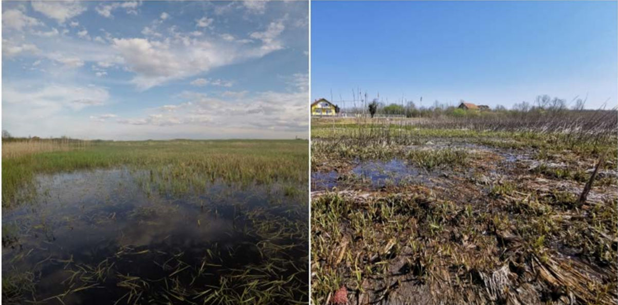
Fig. 3. Water level at the same pond: March 2018 and March 2020 (the highest water level)

Last autumn and winter (2019/2020) had minimum rainfall and no snow. The consequences can be seen in spring 2020 at the water habitats in Cardak which are almost dried out. Another reason for the low water level is a high area covered mostly with Thypha latifolia whose rhizomes have been absorbing all precipitation water. Since 2014 the Cardak pond has never be drier (Fig. 3).