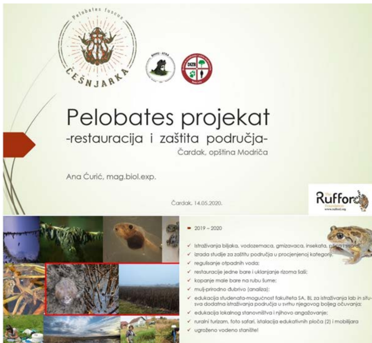
Fig. 1. Presentation: local community meeting

The project activities started in winter 2019 with preparation of all necessary presentations for the educational part of the project, preparing letter for ministries, high schools and faculties, meetings with experts and scientists from Serbia and Croatia who are experienced in water bodies restorations, and project team meetings for planning all research of flora and fauna in 2020.