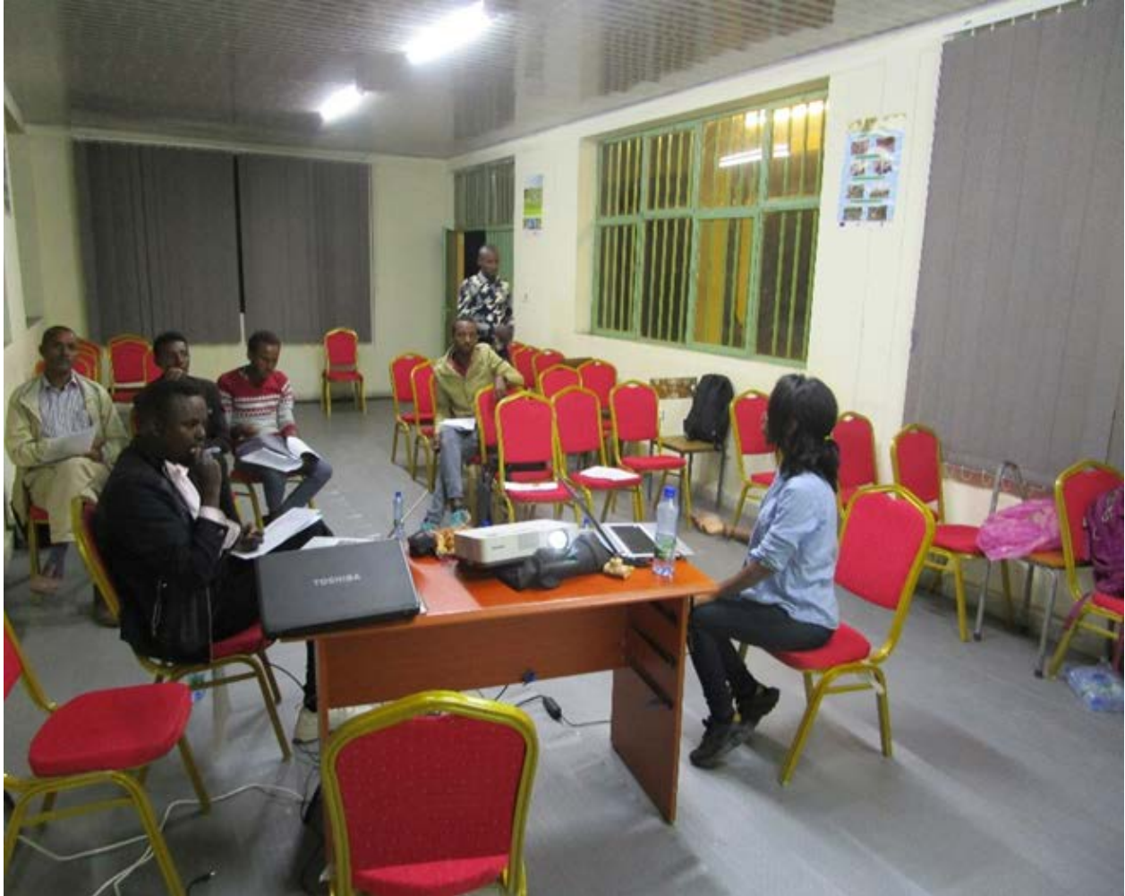
Figure 6: Training enumerators for second round of data collection

We formed new partnership with Oromia Forest and Wildlife Enterprise, Frankfurt Zoological Society and Ethiopian Wildlife Conservation authority which are organizations that oversee and facilitate the implementation of Community based controlled hunting program. We have also formed partnership with four new communities where the project is implemented.