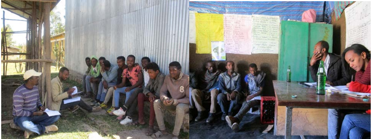
Figure 5: Women and Youth groups in focus group discussion: Results showed both women and youth were the least likely to participate in CBO decision making or perceive these outcomes as fair