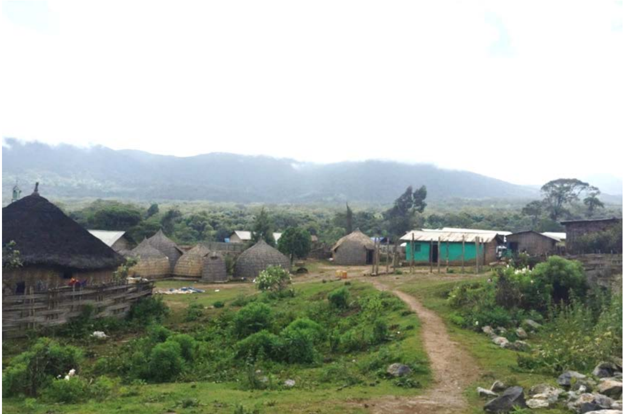
Figure 1: Town of Rira at the heart of Bale Mountains National Park testament to the growing human pressure on protected area