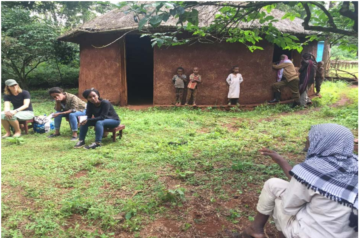
Figure 2: Preliminary Discussions with Community Groups in the Bale Mountains

We use a grounded qualitative approach and apply a multi-dimensional equity framework to assess locals' perceptions of equity in the distribution of benefits and costs, the processes of engagement and participation, and the recognition of traditional land use practices and values, paying attention to the inter- and intra-community power dynamics, institutional characteristics, and broader contextual factors that shape perceptions.