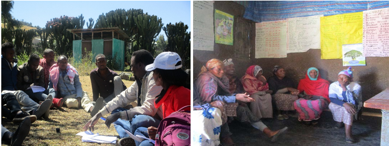
Figure 4: Focus group discussions with different community groups