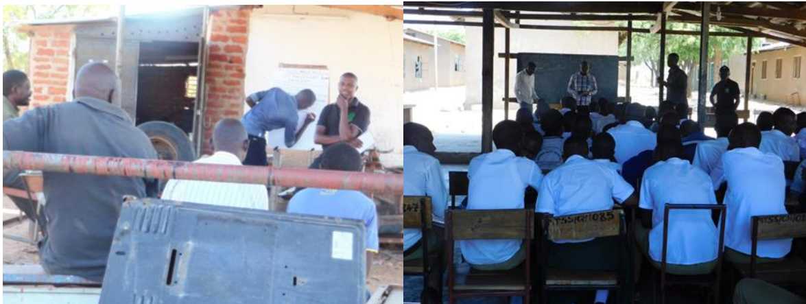
Left: Participatory rural appraisal with the fishermen. Right: Conservation education at Mtera secondary school.