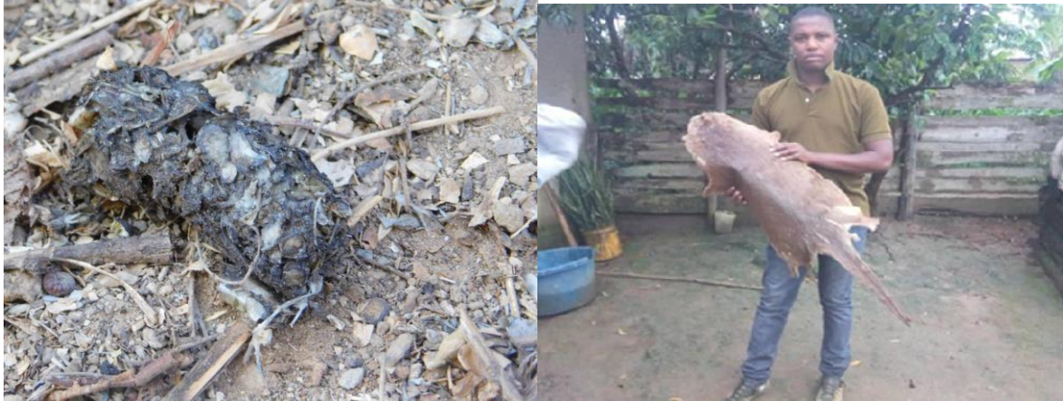
Left: Scats found during ground transect. Right: African clawless otter skin found in one of the fisherman household. It is used to lay babies soon after birth and part of the ski will be tied to their arm (bracelet like) to avoid some inherited diseases.

Full details of the methods and result are on the upcoming published article which will be in open access journal.