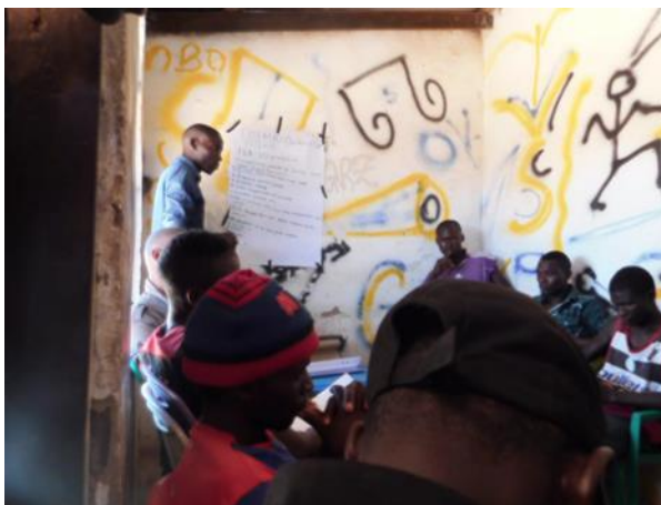
A meeting with fishermen in Mtera DAM, (CHIBWEGERE VILLAGE) conservation awareness.