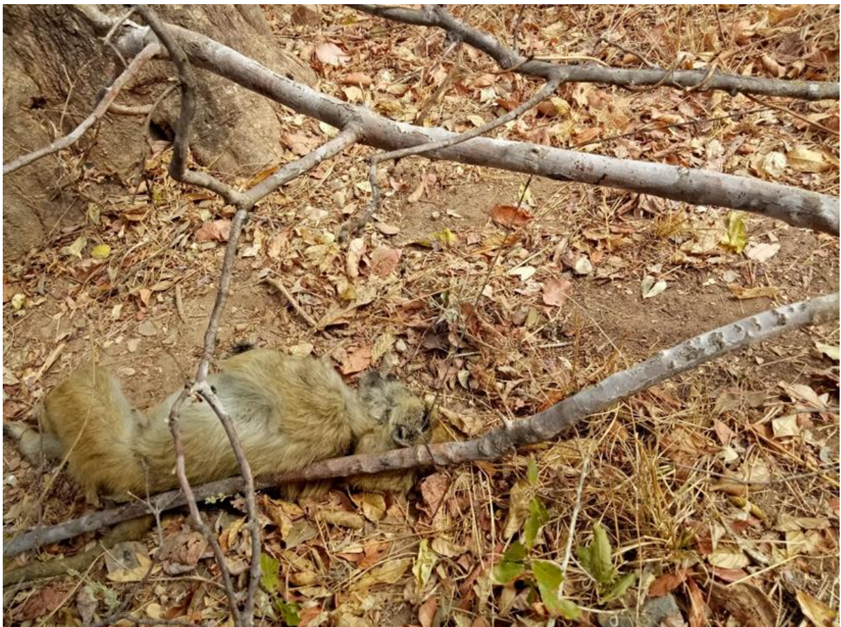
A young baboon killed in a snare at Vwaza Marsh wildlife reserve.