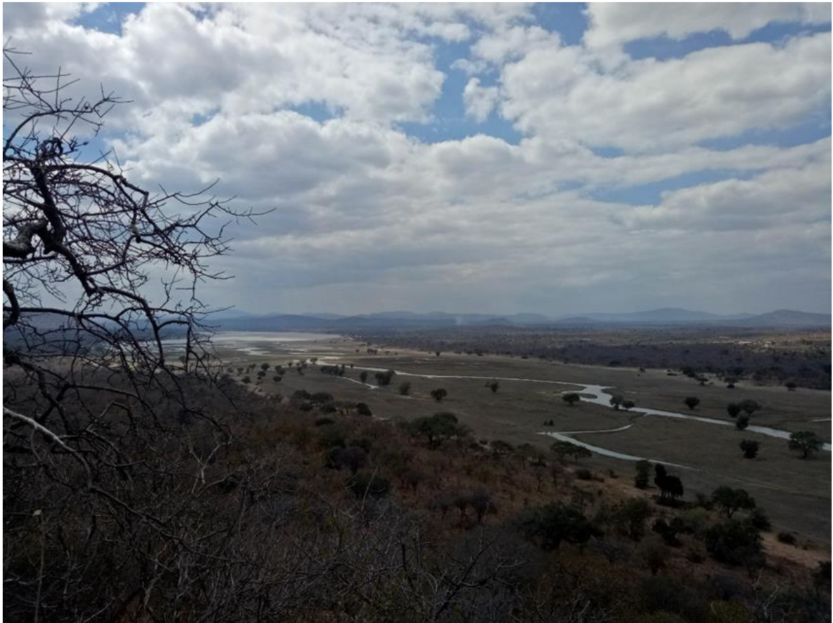
The floodplain at Vwaza Marsh wildlife reserve, one of the protected areas around which we surveyed households.