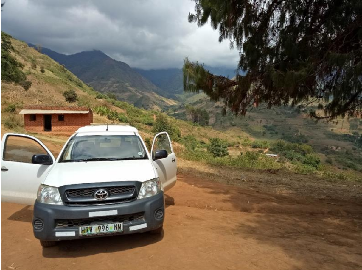
Our fieldwork vehicle, at a remote site located near the top of the Nyika Plateau.