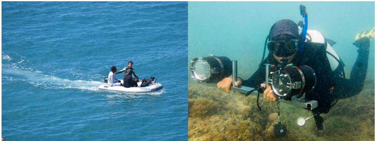
Left: Boat facilities from the Abrolhos Marine National Park. Right: Dive Operated Video (DOV) used to collect the minimum approach distance data.

During this period, we (my team and me) were able to sample in eight different sites within the Archipelago area, performing 25 dives. All of the equipment worked very well and allowed a good sampling.