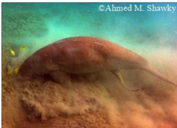
Figure (2): Feeding Behaviour

Approach and fleeing behaviour was observed in the presence of tourism activities. The dugong sometimes approaches the divers in some circumstances. This may be due to the territory of the dugong in a specific area where the presence of divers in a special place for a long time took place. Fleeing behaviour was mainly recorded at the surface when dugongs ascend for breathing. The snorkelers waiting at surface swim directly over the dugong mainly to approach and to touch. In this situation, I recorded the dugong change the direction and move away from the snorkelers a few metres and ascend to take a quick breath. This attitude from snorkelers has a harmful effect to the dugong, where it may prevent the dugong from breathing in time. This may be discussed why the dugong it travelling more or less from each site according to the presence of a disturbance. Also, the dugong may travel away due to the sound of boat propeller which has a direct impact. The more underwater survey is needed to collect more videos in a different situation to get a definite conclusion for the effect of tourism activities on the dugong behaviour. The example of these results will used in the presentation for the tourist and tour guide. It will help them to understand the different behavioural categories of the dugong hopefully to get a code of conduct for dugong watching.