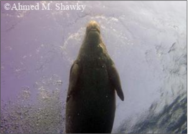
Figure (5): Dugong take a breath at the surface