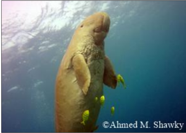
Figure (4): Dugong Ascend to the surface