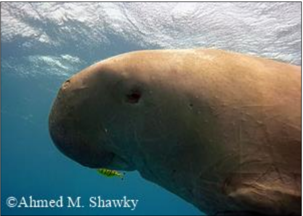
Figure (5 and 6): Dugong approach to the observer