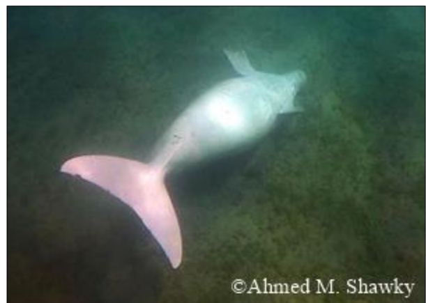
Figure (3): Rolling Behaviour