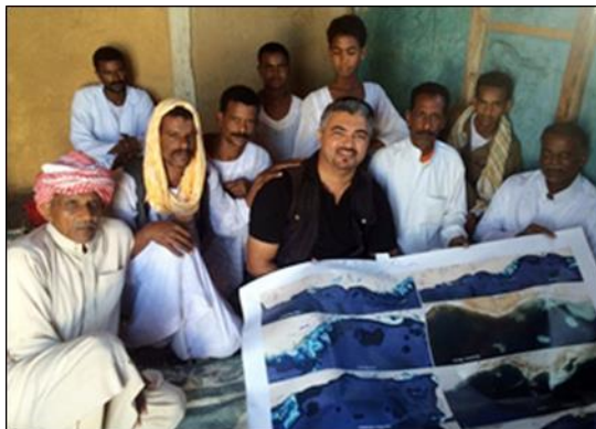
Figure 2: Conducting questionnaire survey with fishermen at Tondoba village