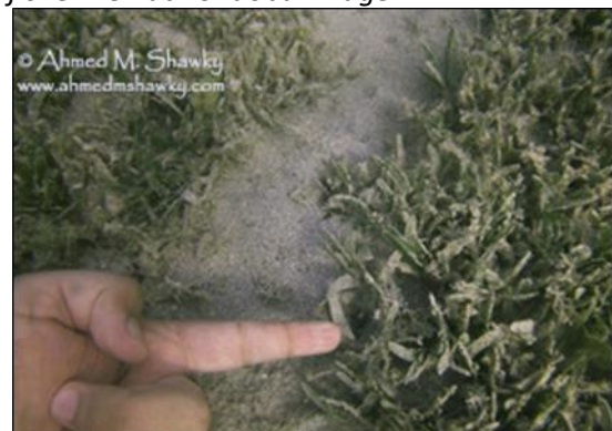
Figure 4: Feeding trail for small dugong