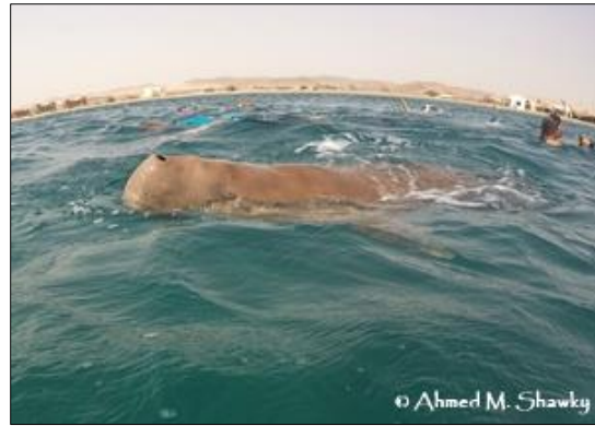
Fig 21 and 22: Dugong inhale at surface to breath