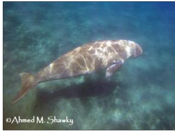
Fig 6: Dugong encountered at Marsa Hermez