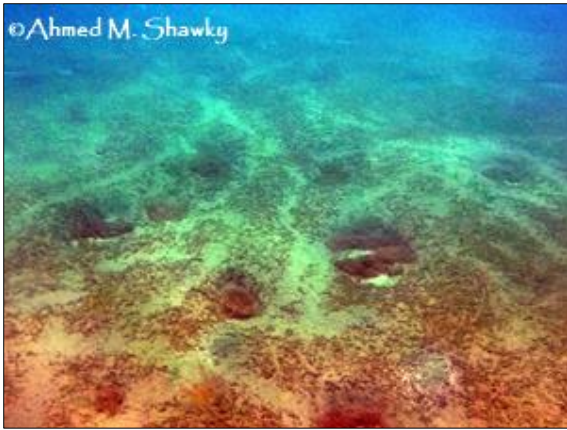
Fig 3: Feeding trails at Marsa Abo Dabbab