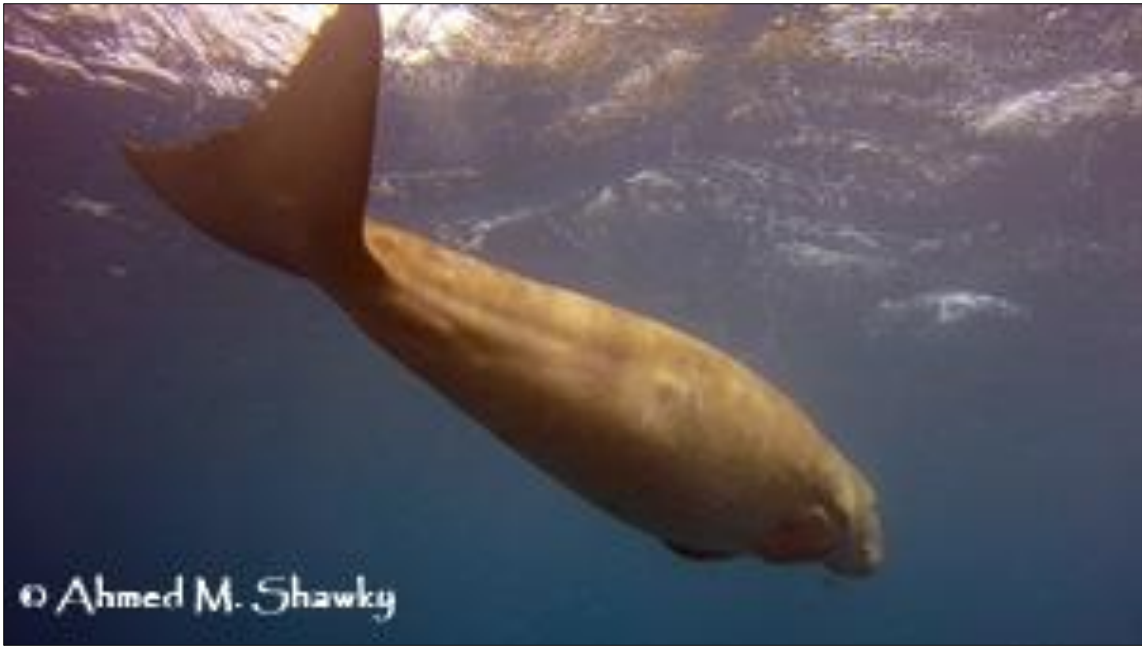
Fig 16: Dugong behaviour (travelling)