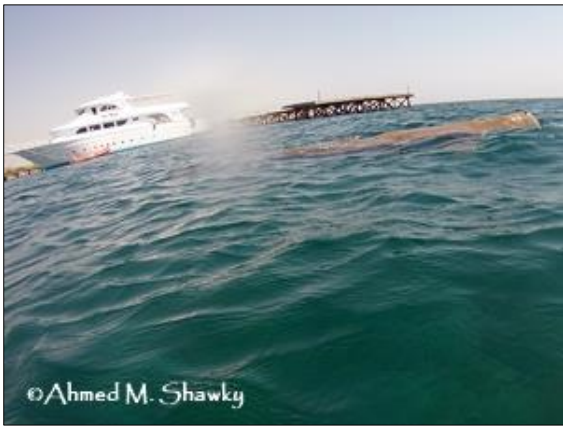
Fig 5: Dugong behind the Jetty