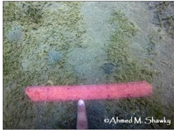
Fig 3: Feeding trails at Marsa Hermez