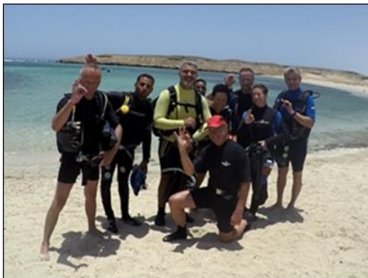
Fig 1: After diving at Marsa Asalaya

I did one presentation to the staff of Blue Ocean Diving Center at Marsa Abo Dabbab (Fig 27 and 28). The presentation includes; sirenian taxonomy, distribution, ecology, behaviour, survey methods and conservation.