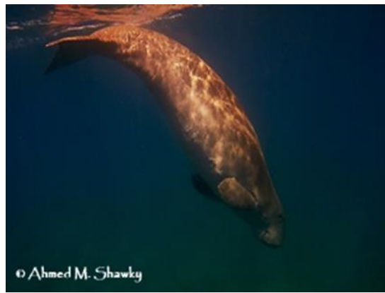
Fig 14: Surfacing behaviour (descending)