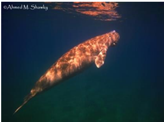
Fig 13: Surfacing behaviour (ascending)