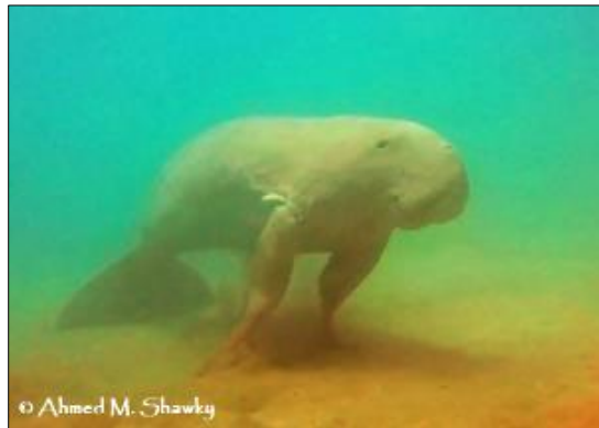
Fig 17 and 18: Dugong start actively after resting on the substrate