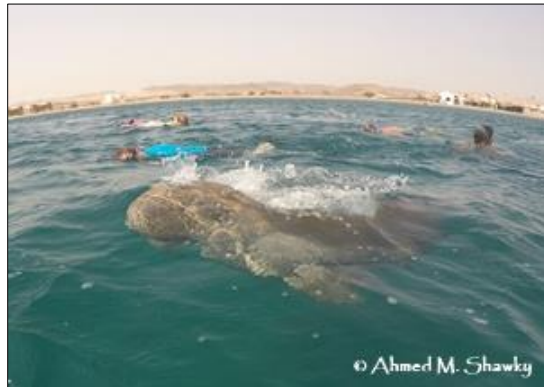
Fig 19 and 20: Dugong exhale at surface before breathing