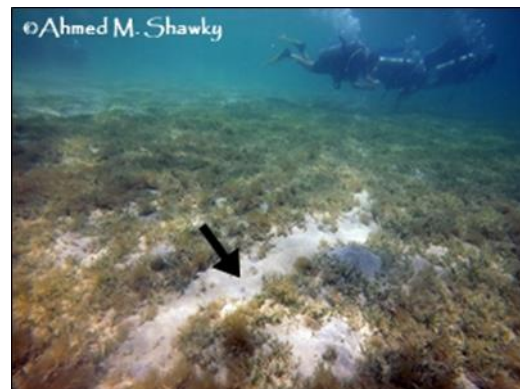
Fig 2: Feeding trail at Marsa Asalaya