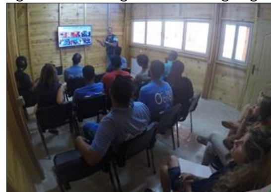
Fig 27 and 28: Dugong presentation for the staff of Blue Ocean Diving Center