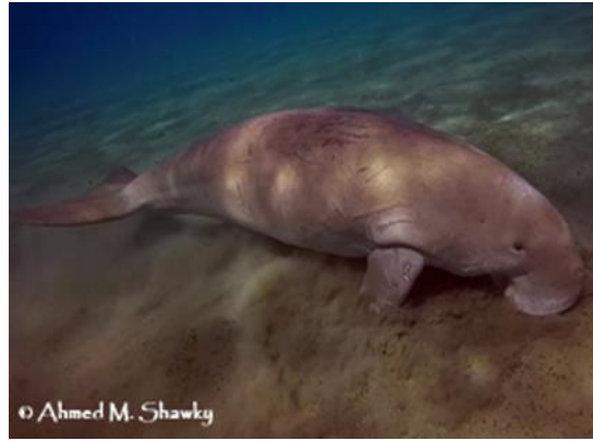
Fig 12: Dugong feeding behaviour