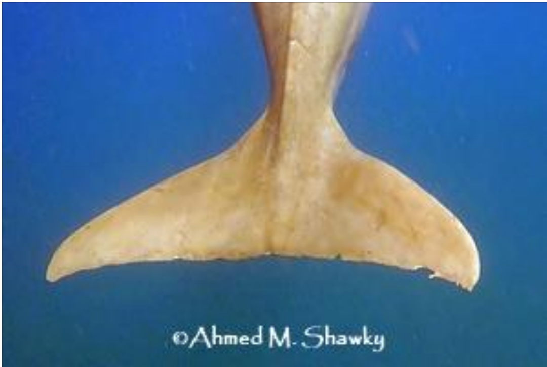
Fig 9: Photo ID of the dugong tail showing a clear notch at the right fluke