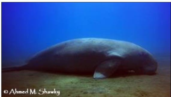
Figure 15: Dugong resting at mid water (left) and on substrate (left)