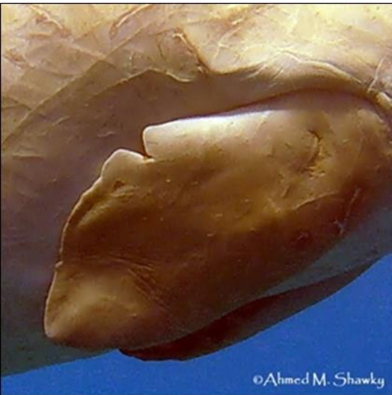
Fig 7: Photo ID of the right flipper