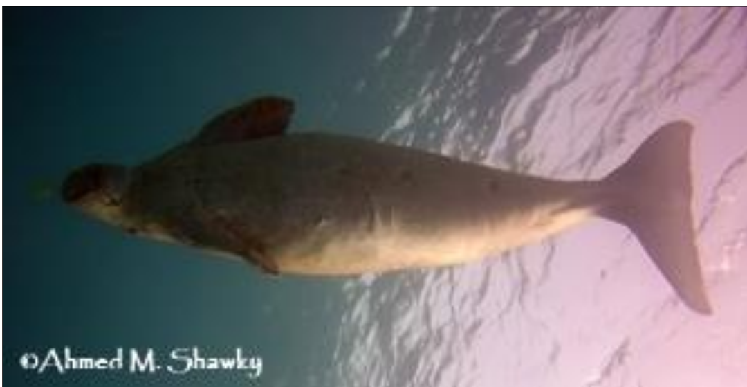
Fig 10: Ventral view of a male showing the position of the genital slit and anus.