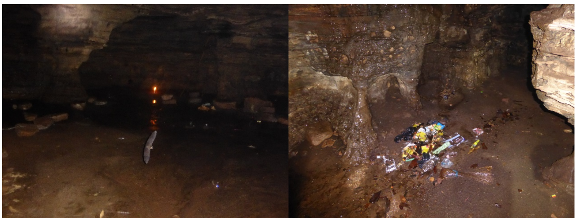
Left: A candle lit in a bat cave for prayers. Right: Litter left behind by a church group in a cave