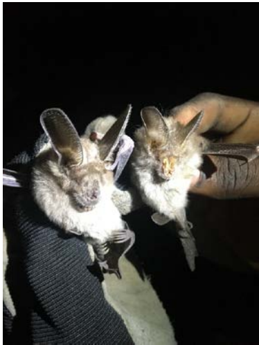
Nycteris macrotis & N. hispida