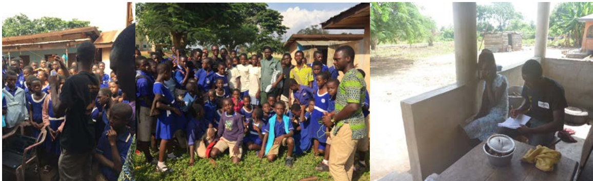
Left & Middle: School educational outreach. Right: Interviewing of local residents