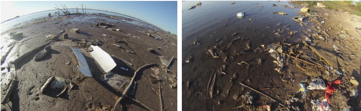
Figure 3. Pictures from the Thompson's beach showing the extreme pollution recorded during the sampling campaign. Note that the pollution is mainly given by macro-plastic debris.