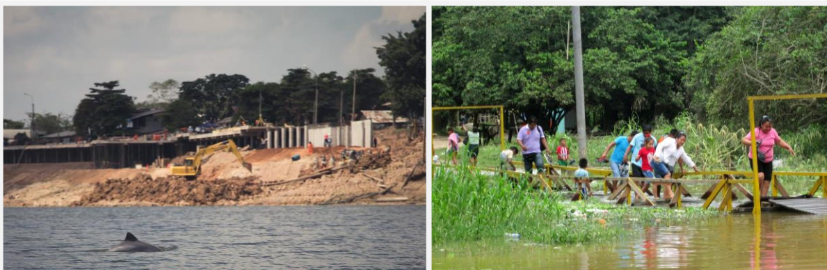
Figure 1. Left: A Sotalia fluviatilis observed in Yarina-cocha lagoon, construction work done in the background. Right: The bridge to the Restringa port inundated, restricting access to tourist boats, restaurants.

Construction work at port: Before and for the duration of the project, the municipality of Yarina-cocha and the Ministry of Culture and Tourism are building a pier and walk-way at the Coronel Portillo port. The construction was supposed to last a year, but has been delayed. Tourist boats, restaurants and souvenir stores have been moved from the port to the Restringa area. The Restringa area is further away from the main plaza in Yarina-cocha and is difficult for tourists to access (rough dirt road, frequently inundated with heavy rain, not accessible by taxi motorbikes). The area close to the construction site was noisy and dirty, making a tour around Yarina-cocha this reduced the number of tourists in the area, as well as the number of boat operators. Many picked up additional jobs in the city. The construction made survey collection, talking to boat operators and artisans difficult. We could work around these difficulties by spending more time at Restringa, and by communicating by phone with boat operators and artisans before we were in Yarina-cocha. By doing this we guaranteed attendance to our meetings and workshops.