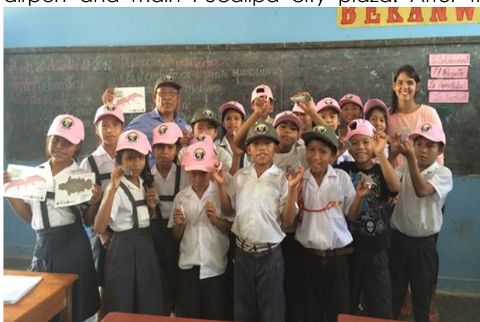
Figure 8. Children from the San Francisco Native community elementary school cutting and building their river mammal cut-outs.

We designed a survey and surveyed tourists in Yarinacocha. We found that tourists were hesitant to give out economic information, possibly because they were scared that it was a security threat while in Yarinacocha. We also had difficulty finding tourists, we expected to find them close to the plaza and port but because of the construction we believe that tourists preferred to be in quieter areas. We successfully interviewed 16 tourists, most of which were local tourists. Of these, we found most were on business travel (56%), stayed 2-3 nights and had a low interest in visiting Yarinacocha, did not know about river dolphins in Ucayali. This shows that tourism in this area is not fully exploited and still has potential. If most of the tourists were on a short visit, Yarinacocha is an ideal place to visit being only 15 minutes away from the airport and main Pucallpa city plaza. After the field trips were completed, we