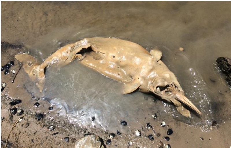
Figure 6. One of four river dolphins found stranded in Yarinacocha. This is a juvenile Amazon River dolphin ( Inia geoffrensis )

can e-mail boat operators and schedule a tour, as well as discuss special interests and cost ( Website ). Boat operators also formed a stranding network “Kushushka Kuiranai” (In shipibo language, Dolphin Rescuers) that reports dolphin strandings in Yarinacocha to team members and responsible local government agencies. Because of this, we have been able to build a database with reported strandings in Yarinacocha ( Figure 6 ).