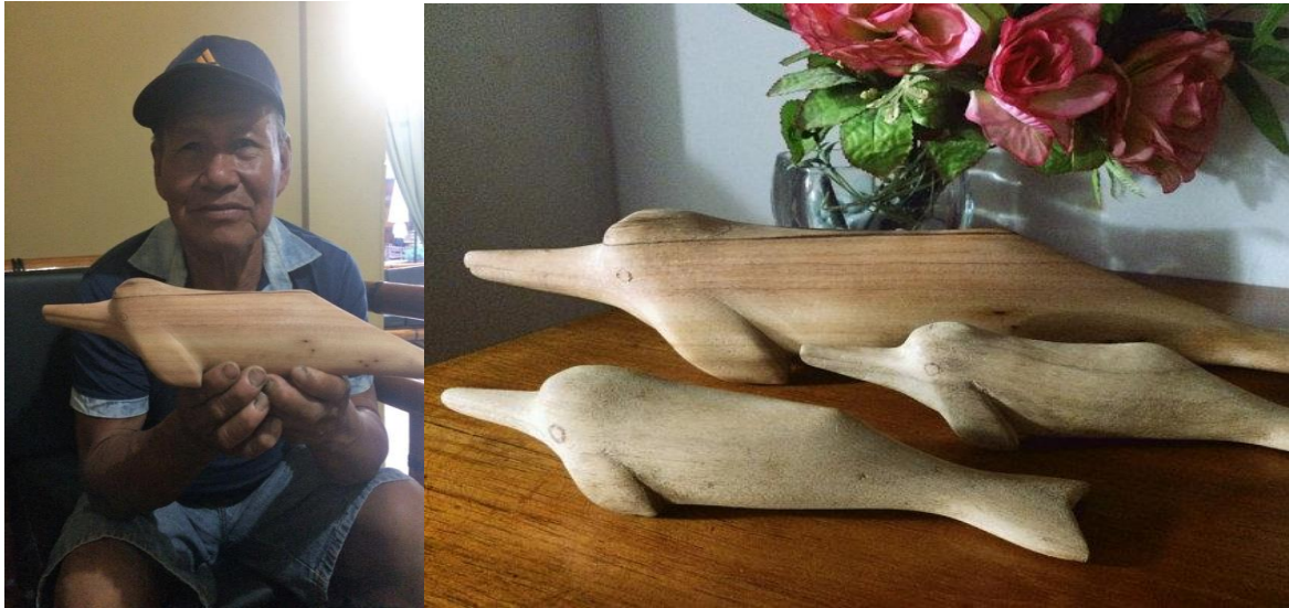
Figure 4. Wood artisan, Nemesio, with river dolphin carvings

They were designed in two sizes: small (15 cm/6 in) and medium (22 cm/8.5 in). These artisans will continue to sell river dolphin souvenirs as part of the tourism circuit, as well as web listings ( Website , Etsy ).