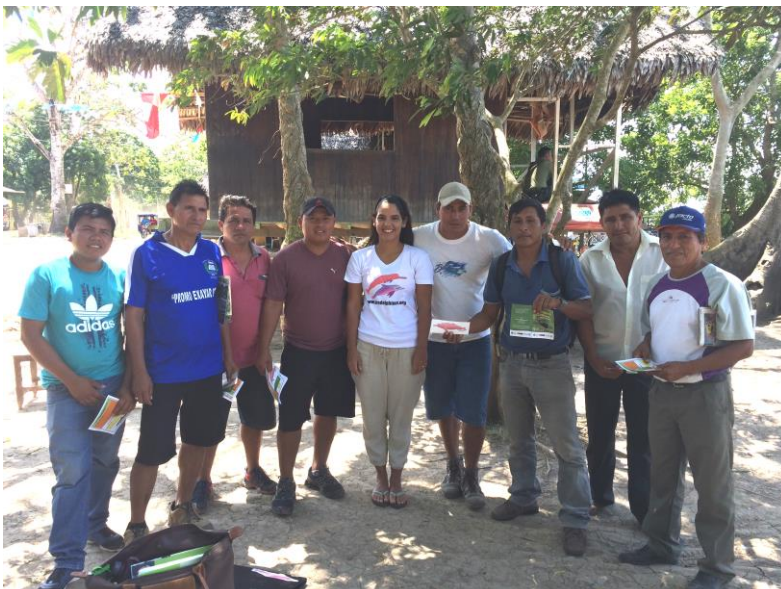
Figure 5 Final workshop with boat operators in Restringa port.

We also identified and worked with boat operators from Yarinacocha city. The project worked with 10 boat operators throughout the year. Four workshops with boat operators talked about the following topics, in order: Project presentation and