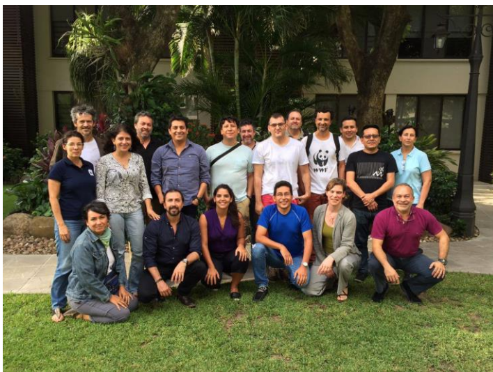
Figure 9. Meeting in Santa Cruz, Bolivia with regional experts to discuss future river dolphin conservation projects.

Local and national government officials also received information of the project in