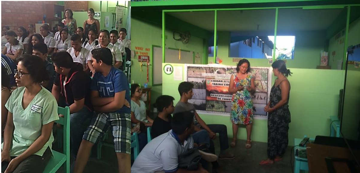
Figure 8. Presentation at Sollertia School in Pucallpa, Ucayali

facts of river dolphins, cut and build two aquatic mammal figures ( Figure 5 ) and finalized the presentation with a compromise from each student towards environmental conservation. A total of 59 students learned about river dolphin conservation. A fourth presentation was given to undergrad students from the Universidad de Alas Peruanas in Pucallpa city. Fifteen students that were studying