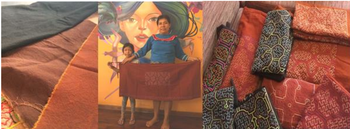
Figure 2. Design of wrap skirt in three different colours

We identified four artisans, three that have been committed to the project. We had five meetings with artisans in San Francisco community, Yarina and Lima city. These meetings discussed conservation status of river dolphins, possible designs related to river dolphins, progress meetings, venues to sell products as well as economic formalization. We came up with three final designs that would be sold as part of the