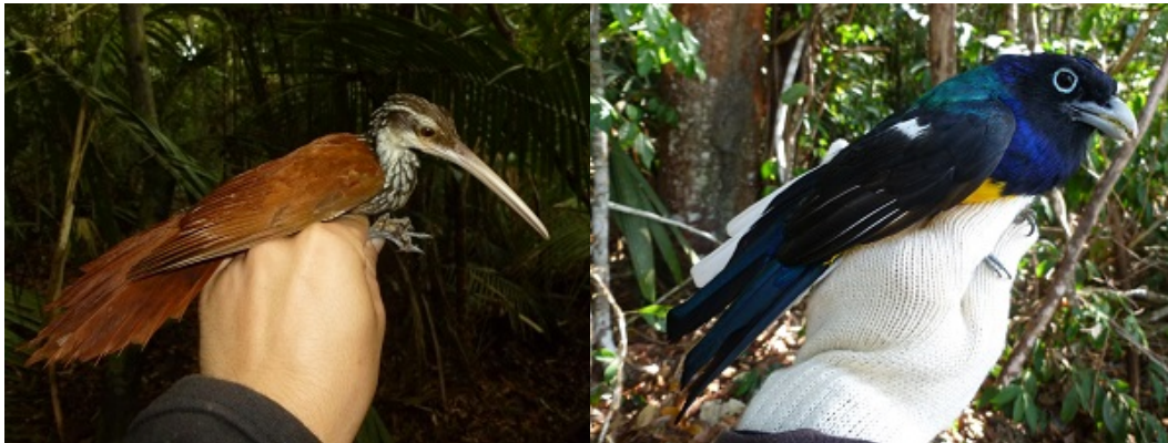
Left: Long-billed Woodcreeper ( Nasica longirostris ). Right: White-tailed Trogon ( Trogon viridis ).