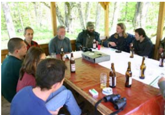
Meeting of the project team