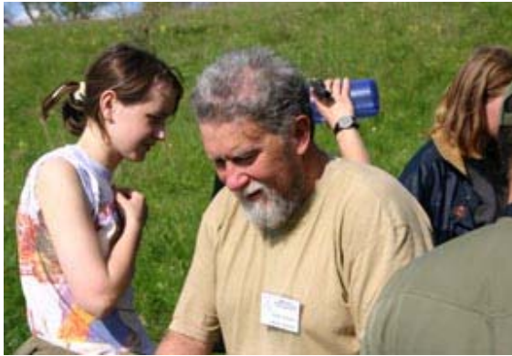
A working day in the Gorge