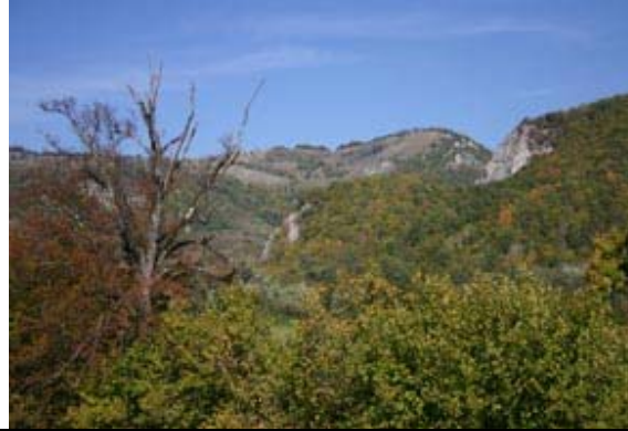
View of Gorge from South