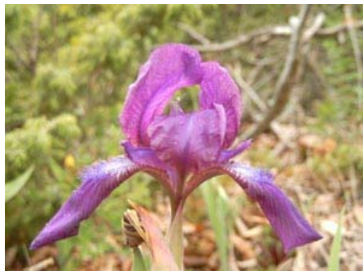
Protected species ( Iris aphylla )