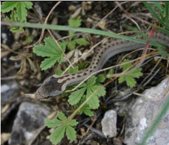
Protected species ( Vipera berus )