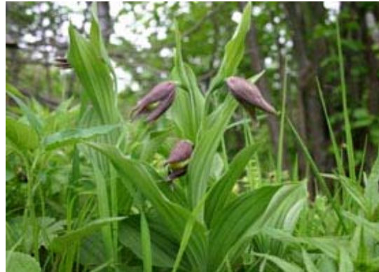
Protected species ( Cypripedium calceolus )