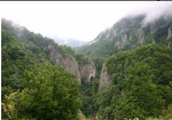
View of the Gorge from North