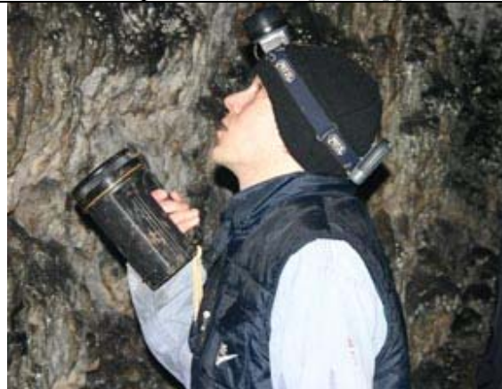
Bat watching in Orbán Balázs Cave