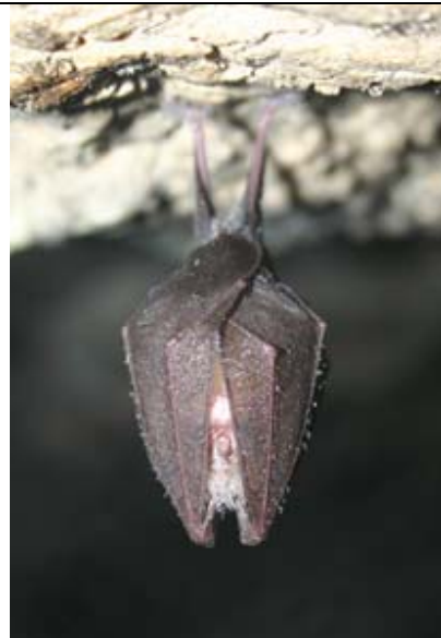
Protected species ( Rhinolophus hipposideros )