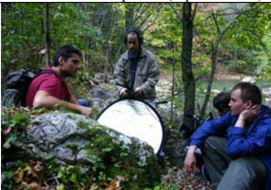
Making the film